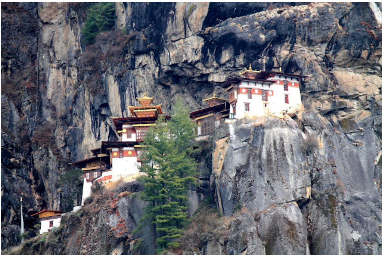
Image Attribute: Paro Taktsang a.k.a. Tiger's Nest (March 2023)

However, the Bhutanese government wanted to open its doors to only some foreign tourists, and the restrictions were primarily due to political reasons. The monarchy aimed to safeguard its popularity among the citizens and maintain autocratic control by preventing exposure to democratic systems or the outside world. But in 2008, Bhutan eventually adopted its first modern Constitution, codifying government institutions and the legal framework for a democratic multi-party system.