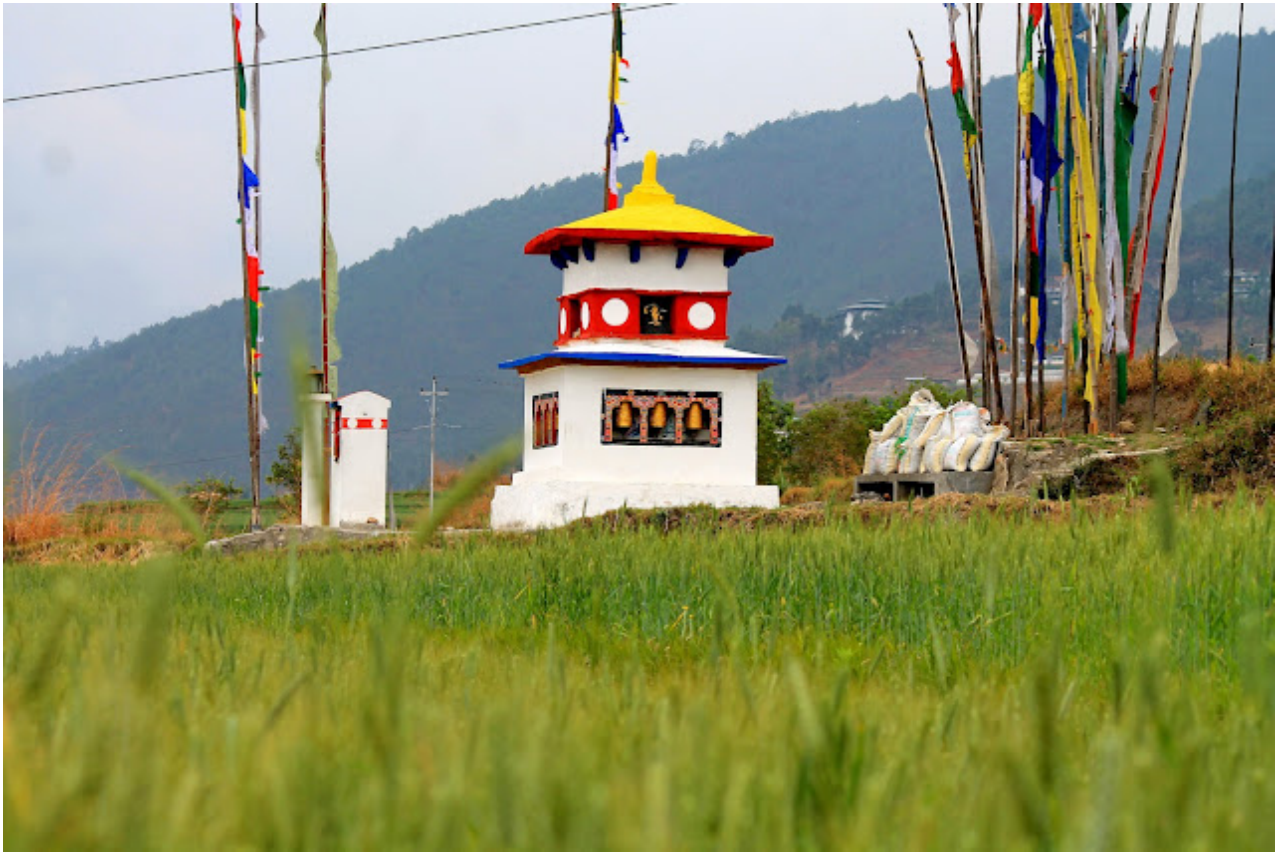
Image Attribute: Paddy field, near Chimmi Lakhang (March 2023)