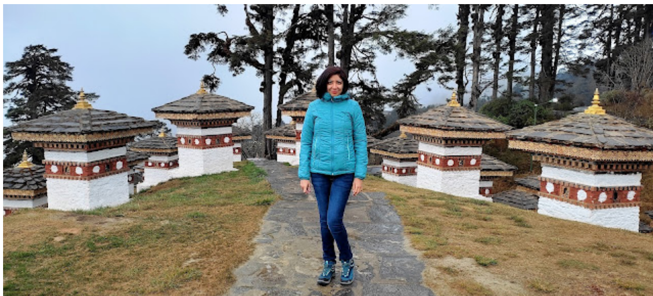
Image Attribute: Author at Dochula Pass (March 2023)